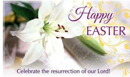
Celebrate the resurrection of our Lord!

9:00a Worship-Sanctuary 10:00a Sunday School 11:00a Worship-Sanctuary & Online 5:00-6:00p The Gathering-Rm. 110